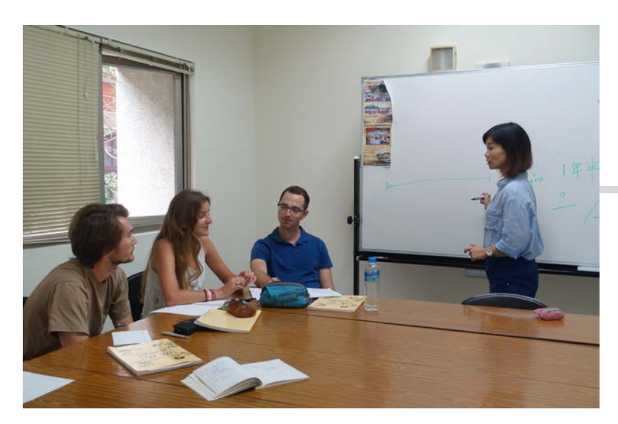
Qualified teachers, acknowledged by Ministry of Education, Taiwan.