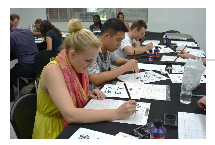
FREE cultural classes Calligraphy Chinese painting Tai-Chi